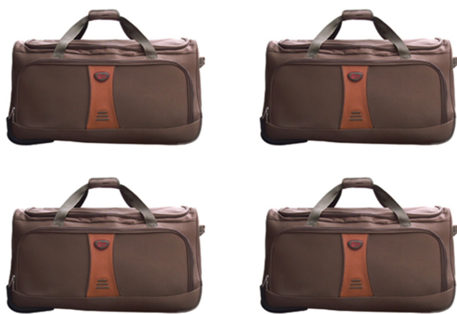
4 Small bags