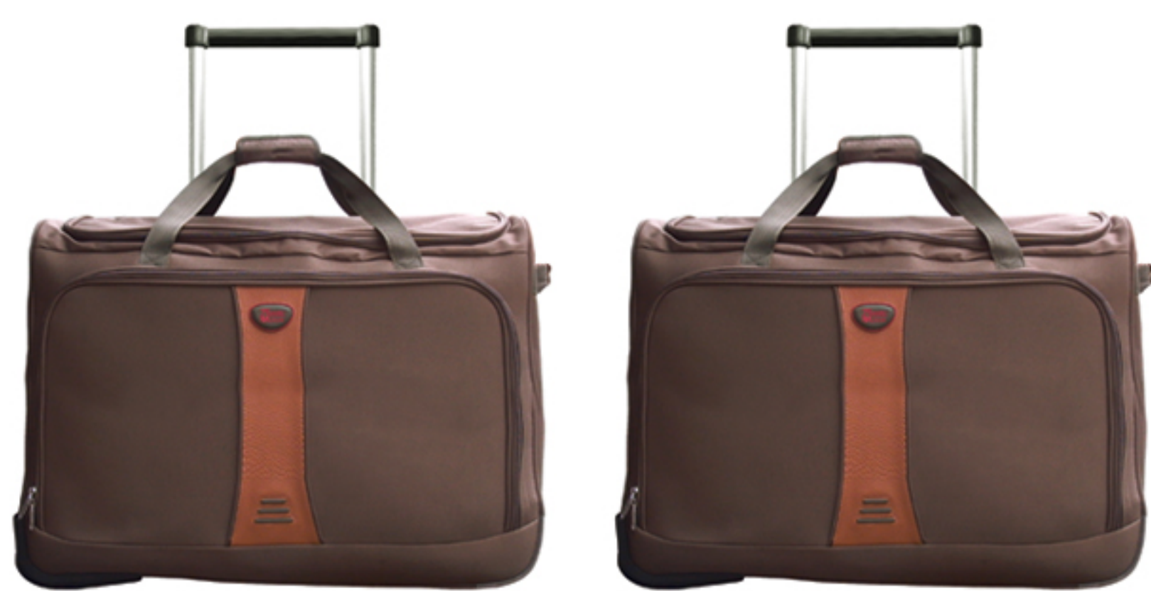
2 Garment bags